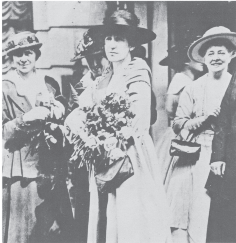
MISS RANKIN FETED BY SUFFRAGE LEADERS, APRIL 2, 1917

Her maiden speeches will be known For charm and grace of manner But who on earth will chaperone the member from Montana?