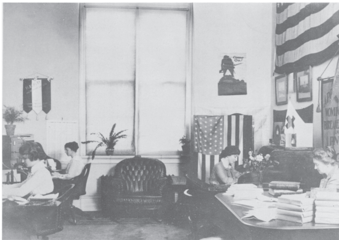
MISS RANKIN'S STAFF AT WORK IN HER WASHINGTON, D.C. OFFICE IN 1918

The next day all the government offices were to close for the long Fourth of July holiday. Miss Rankin, however, put the affidavits in her briefcase, and we went down to the Treasury Department to talk with Secretary William McAdoo, who had jurisdiction over the Bureau of Engraving and Printing. We sat in the waiting room until McAdoo came in. He said he was sorry, but he was leaving for a