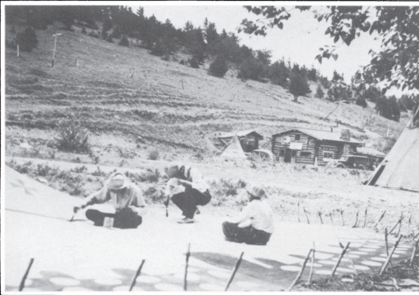
Craft workers paint a lodge cover in preparation for a summer encampment near St. Mary's Craft Shop, probably in about 1937. Popular with tourists, the tipi circles set up near the craft shop drew attention to the Blackfeet craft work.

Then we set up a circle of lodges outside and started a little museum, a perfect replica of an old-time lodge in the best of taste, with the couches and backrests around the sides, the fireplace in the center, the lodge lining with its painted design, the outside of the lodge with its bear or beaver or otter or whatever, very attractive to tourists. We charged them so much, I think a quarter, to go in there. The lodge circle extended around both sides of the road, and in the evening families occupied two of the large tipis. People going up to Many Glacier from St. Mary's would pass between the lodges and stop to see what was going on.